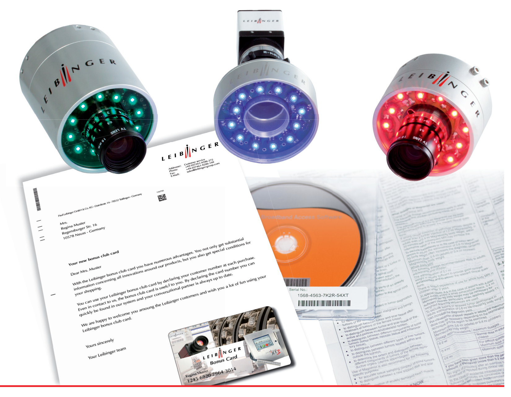
Control and Identification Systems